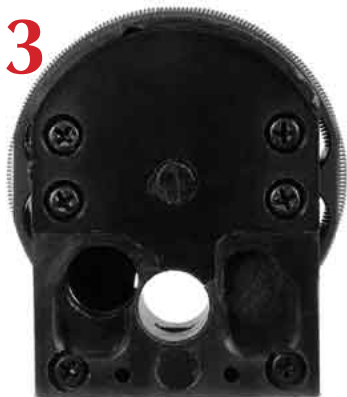
Image 3: This shows the magazine with the spring completely at rest. Notice the tab does not show.