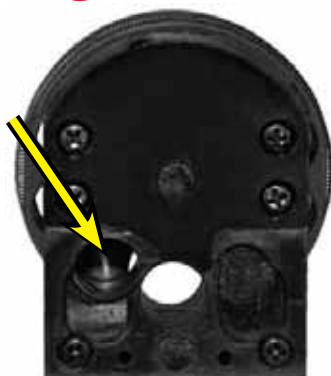
Back of single mag shown. You'll be inserting pellets into the hole on the lower left, as shown by the arrow.