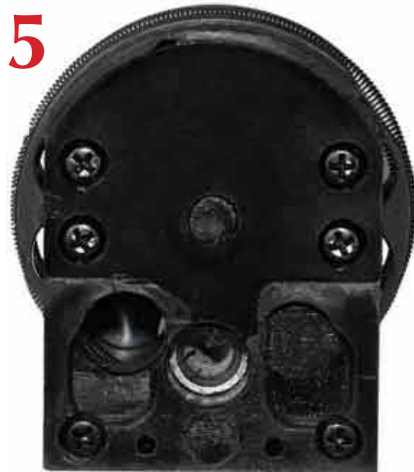
Image 5: After seating pellet, turn mag so pellet appears in center hole and left hole is ready to accept another pellet. Repeat steps 1-5 until mag is filled.

.177-cal. mags are 10mm deep .22-cal. mags are 10mm deep .25-cal. mags are 10mm deep 9mm mags are 11mm deep